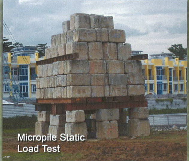
Micropile Static Load Test

Micropiles are essentially small diameter foundation piles which are used in difficult ground and working conditions such as when there are space constraints. They are widely used in underpinning, which provides additional foundation support to structures; in upgrading and retrofitting; as well as in ground where there are boulders or rock. In addition, micropiles in rows can be used as retaining walls